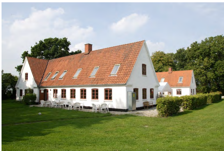
Hegnaarden Development Center at the Island Orø in Denmark

Hegnaarden is situated at the island of Orø – beautifully surrounded by fields, close to the water. Hegnegaarden has its own very special atmosphere – good surroundings for development, presence, being and working together.